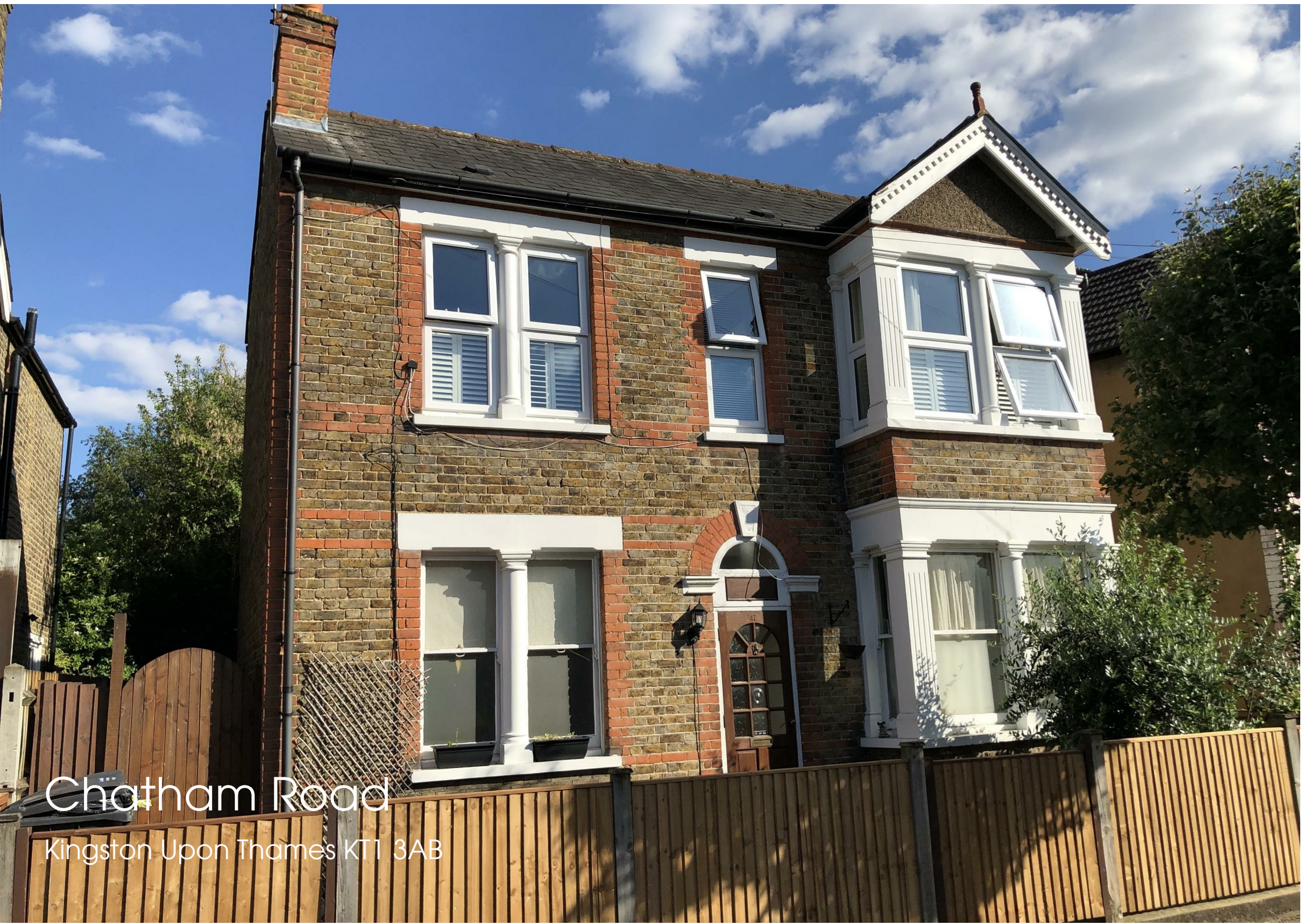
Chatham Road Kingston Upon Thames KT1 3AB

34 Richmond Road Kingston upon Thames Surrey KT12 5ED www.gibsonlane.co.uk Tel: 020 8546 5444